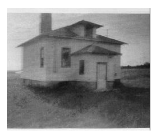
Green Bank School #150 Lynn Township, Day Co SD