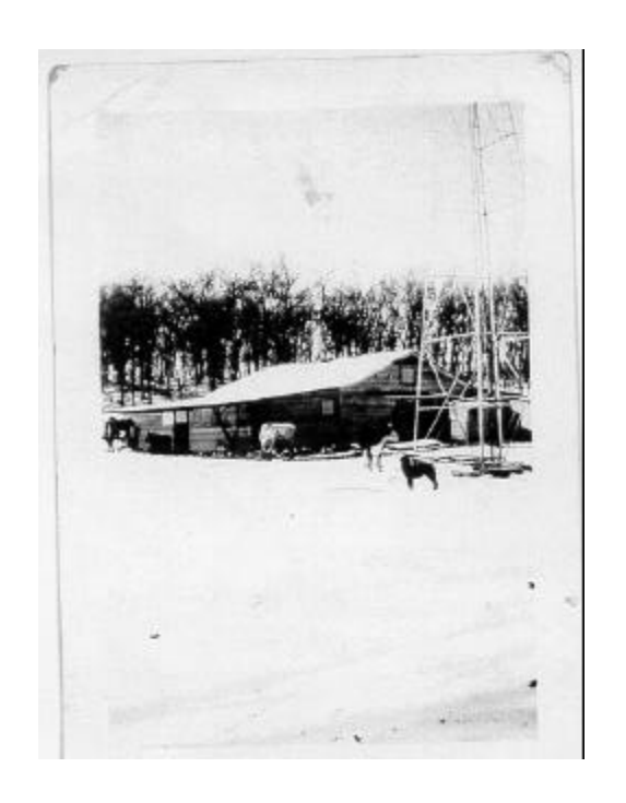
The Barn at Lynn, SD